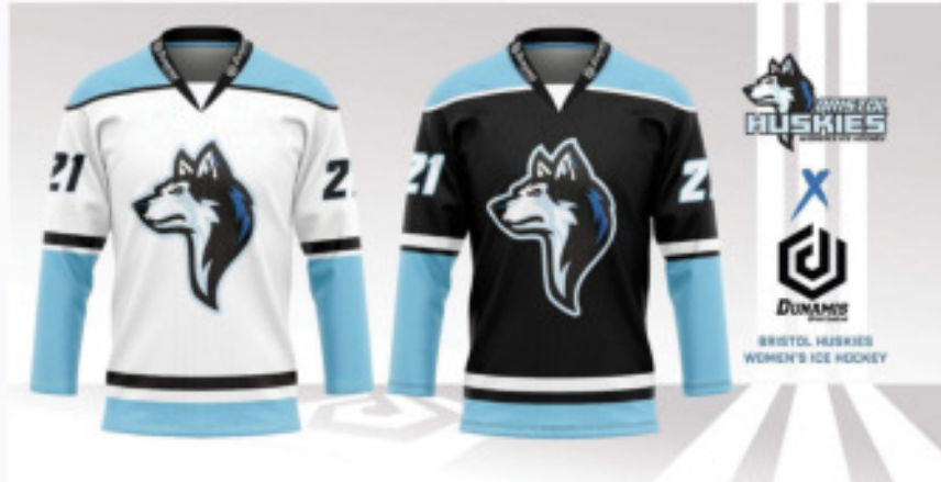
Sponsorship Placement Guide